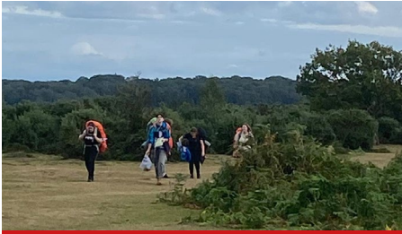
Crestwood students exploring the New Forest on a recent expedition.