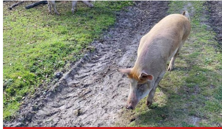
Greeting some of the locals. Fortunately, they weren't on the menu!