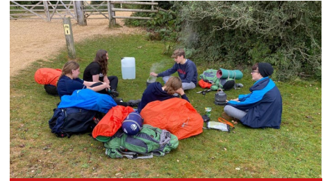
Students enjoying a well-deserved break for lunch!

Do you want to have fun, educational experiences with your friends?